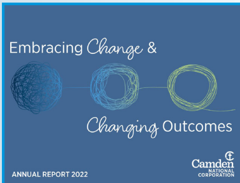
2022 ANNUAL REPORT

DONATED IN TOTAL SINCE THE PROGRAM BEGAN IN 2015