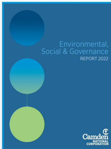
2022 ESG REPORT