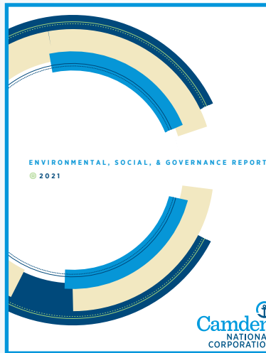
2021 ESG REPORT