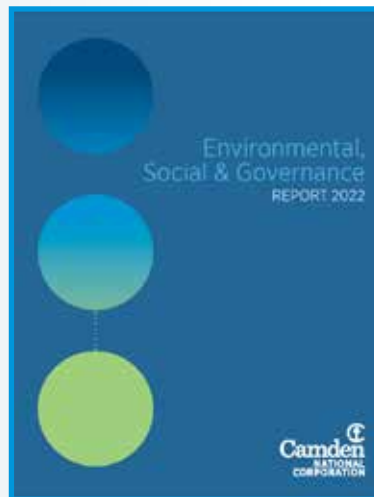
2022 ESG REPORT