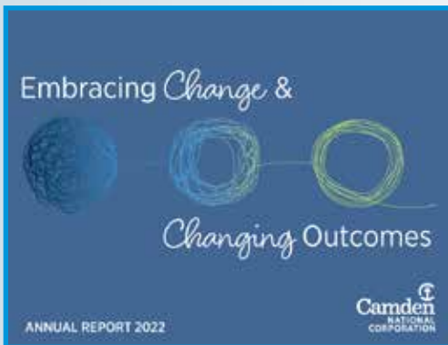
2022 ANNUAL REPORT

DONATED IN TOTAL SINCE THE PROGRAM BEGAN IN 2015